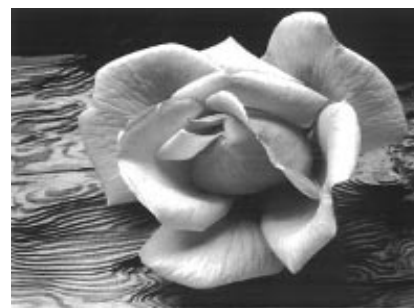
Image from the Ansel Adams show, presently at Lakeview Museum in Peoria.

For more information call 309-829-0011 or visit http://www.mcac.org/Documents/SpringBloomApplication2007.pdf for details and festival application form. Applications are due January 26, 2007.